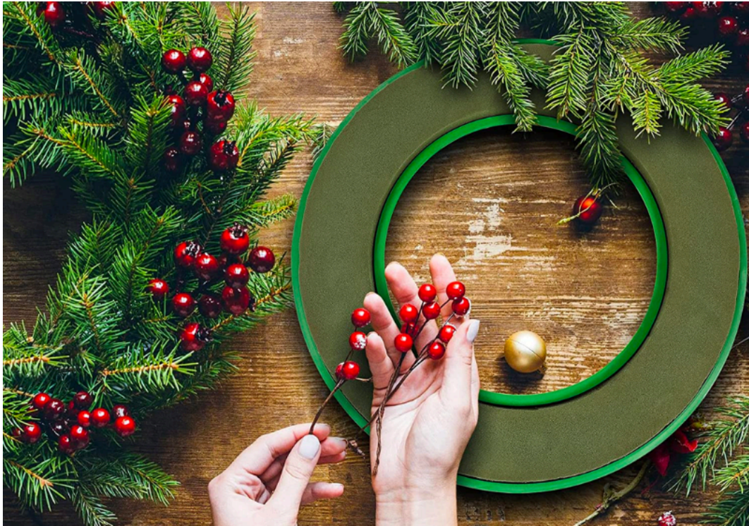
Oasis Rings Available here

It's time to order supplies for your Advent Wreaths – find everything you need here.