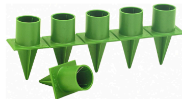
Taper Candle Holder Available here