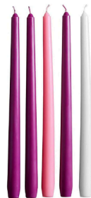
Candles Available here