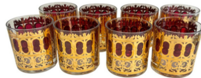
Culver Cranberry Rock Glasses

Fabfoo is a favorite source for vintage cocktail glasses, a great way to style up your barware.