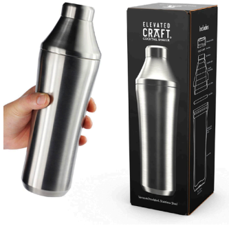
Elevated Craft Hybrid Cocktail Shaker