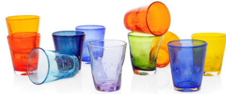
Hudson Grace Tumblers