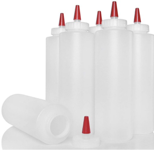
Plastic Squeeze Bottles

Consider plastic squeeze bottles and/or individual sauce cups.