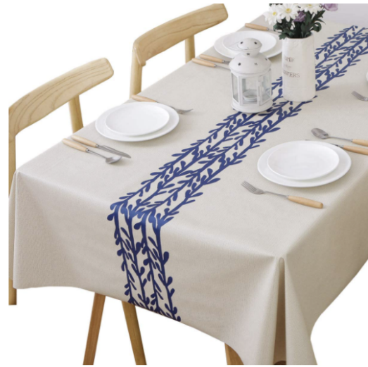
PVC Tablecloth White Plaid | Branch