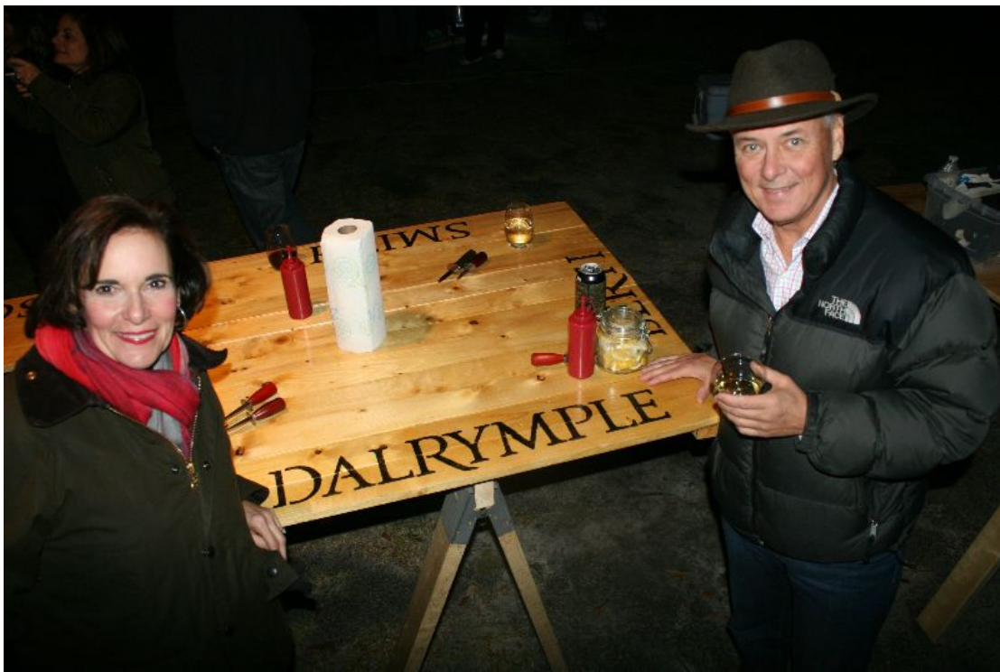
Our Family Oyster Table