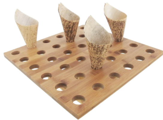
Bamboo Cone Holder

... Perfect for chips, veggies, and dips