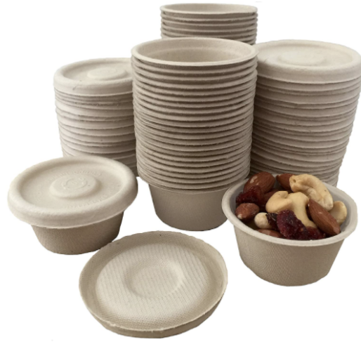
Individual Sauce Cups