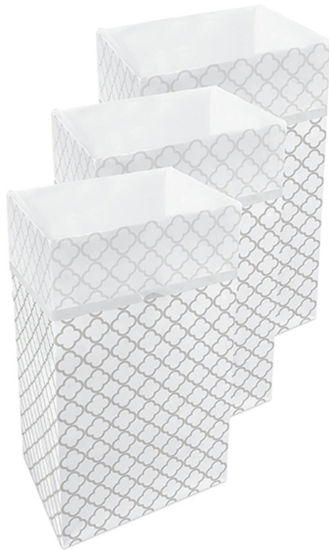
Disposable Trash Cans Available here