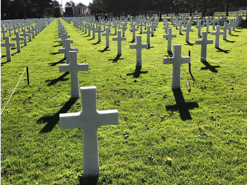
Normandy American Cemetery and Memorial Colleville-sur-Mer, France